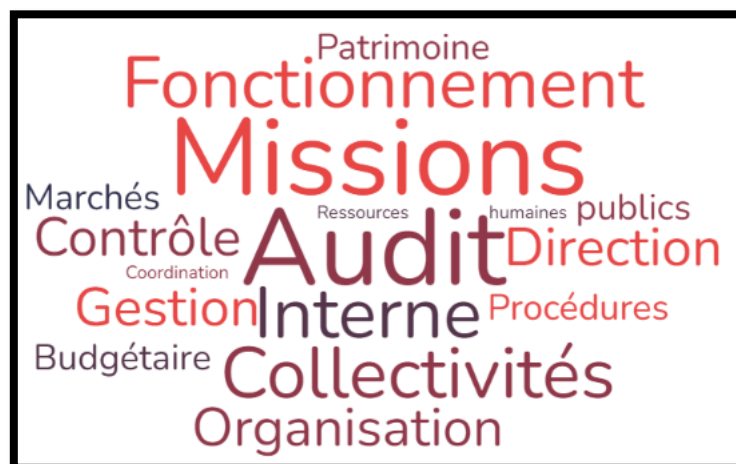
Figure 1. Word Cloud – Axis 1