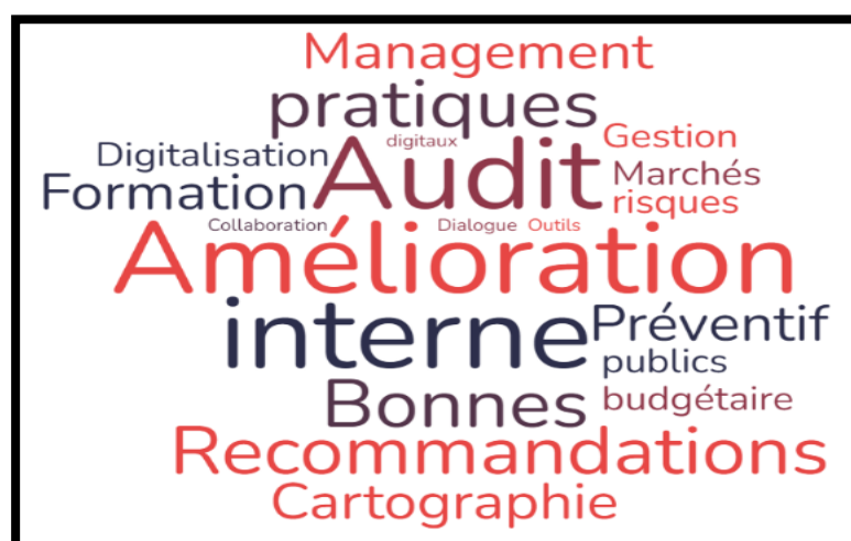
Figure 3. Word Cloud – Axis 3